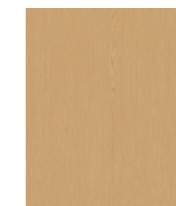
Ivory Infinite Oak